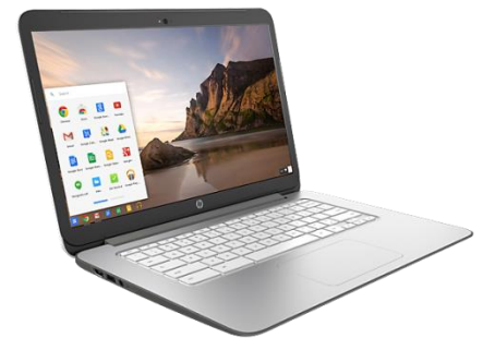
14" HP Chromebook

Applications are available on the website.